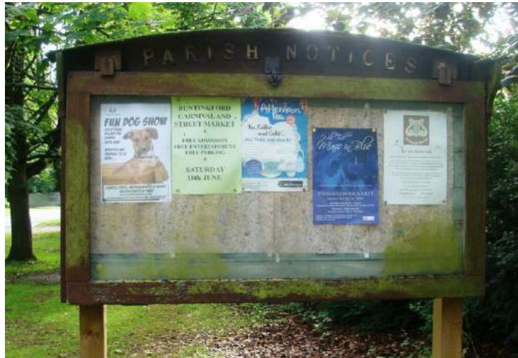
Picture 45. Improvements to the notice board would be beneficial.

5.61. Parish Notice Board. This appears a little dishevelled. Significant improvements could be made with modest effort and expenditure.