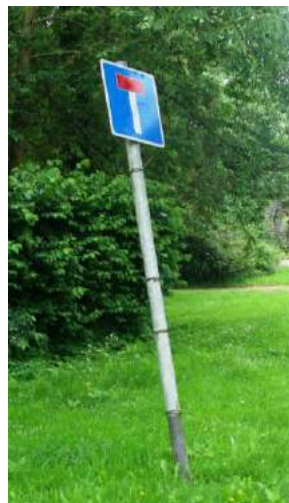
Picture 47. No entry sign Warren Lane needs re erecting.

5.63. No entry sign Warren Lane. Needs re-erecting to assume correct vertical alignment.