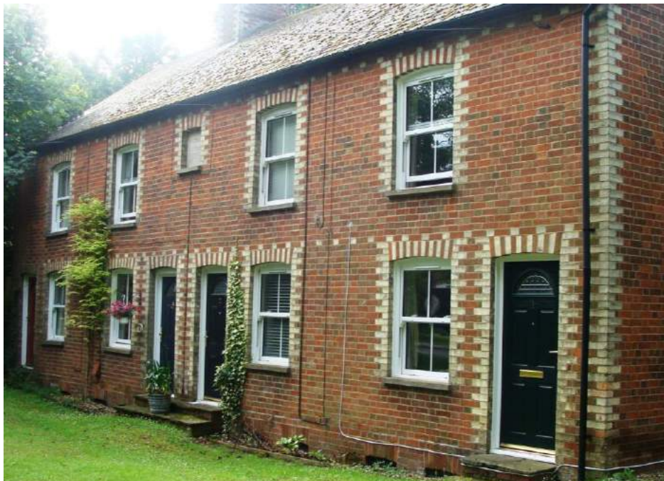
Picture 17. Nos. 1-4 Victoria Cottages - a prominent and pleasing terrace dating from the late 19th century in the centre of the conservation area and largely unspoilt.

5.31. Victoria Cottages (Nos. 1-4) - Baldock Road. Of red brick construction with contrasting yellow brick quoin and door and window surround detailing. Slate roof; 2 No. chimneys and central plaque interpreted as reading 1887. An Article 4 Direction to provide protection for selected features may be appropriate subject to further consideration and notification.