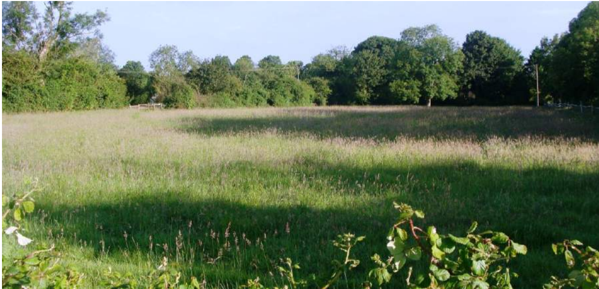
Picture 26. Small scale open space that is considered to be very much part of the spatial quality of the conservation area.

5.45. Similarly other small scale areas of paddock nearby provide a setting for important listed buildings as illustrated below.