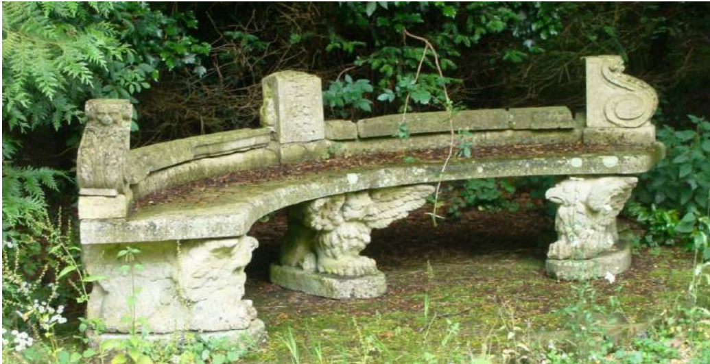
Picture 19. Classical designed stone seat, probably dating from the 19th century or earlier, in the grounds of Cheynes House.

5.38. Classical designed stone seat, probably dating from the 19th century or earlier, in the grounds of Cheynes House.