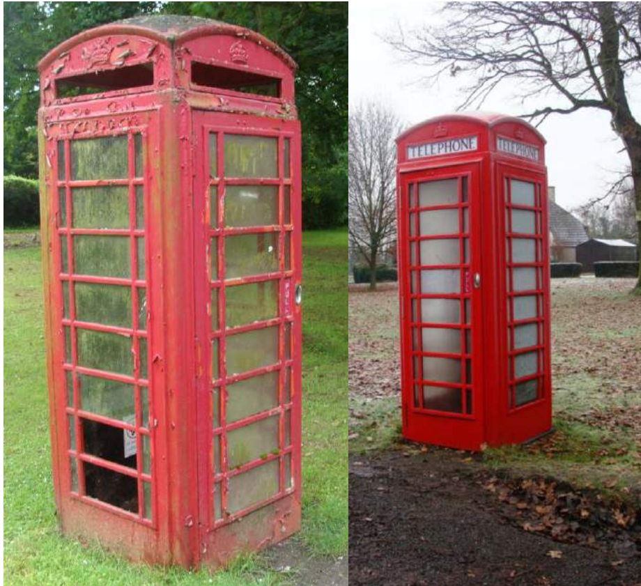
Picture 46. Telephone kiosk left no longer in operational use. An iconic British architectural feature most worthy of repair and retention. Right repaired and looking so much better. Even small improvements like this can make a considerable visual improvement.

5.63. No entry sign Warren Lane. Needs re-erecting to assume correct vertical alignment.