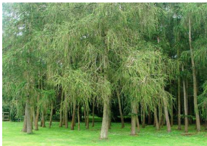
Pictures 35-37. A selection of different species of circular conifer groupings in the historic Registered Park to the west of Cheynes House.