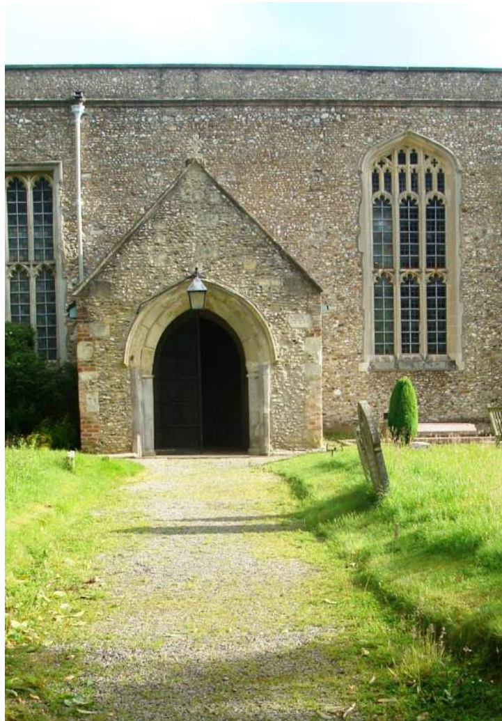
Picture 50-49 Recutting edging and formalising the approach to the church would secure significant visual improvements. Planting the realigned path with traditional churchyard trees such as a short avenue of clipped Irish Yew would be highly beneficial.

5.67. Opportunities to secure improvements. Seek further information relating to listed thatched building in Japanese Garden (illustrated previously) and discuss potential of improvements with owner. Secure improvements to cricket pavilion and associated facilities. Secure improvements to parish notice board. Re-erect No entry sign at north end of Warren Lane. Seek removal of dumped material in field north of footpath 007. Undertake selective repair works and removal of vegetation to church boundary wall. Consider improvements within the churchyard including a new avenue of trees of traditional churchyard species on the main approach path. Consider improving appearance of pond area to east of Childs Farm. Discuss with owner potential for improving thatched roof to ancillary building to Old Forge, Baldock Road. Consider improvements and rationalisation of signage on triangular green to east of The Old Off License.