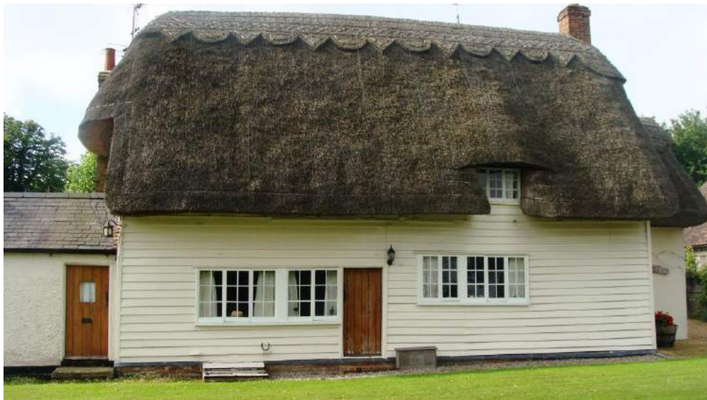
Picture 7. The former Bell PH. One of a number of important listed thatched properties in Cottered.

5.17. The Bell former P.H- Grade II. Early 18th century or earlier, low 19th century east extension. Timber frame weatherboarded with a steep thatched roof. Once a wheelwright's house and The Chequers Public House.