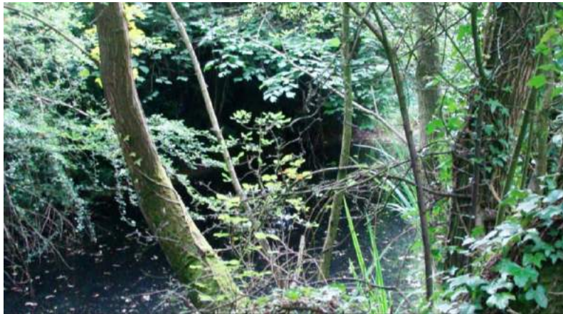
Picture 43. Overgrown water feature to the east of Childs Farm. Is there potential for making it visually more attractive?

5.58. Another water feature adjacent to the public highway and visible from it is to the east of Childs Farm and is illustrated below. Subject to Health and Safety considerations it may be appropriate to consider removal of some vegetation to make it a more attractive feature in the street scene.