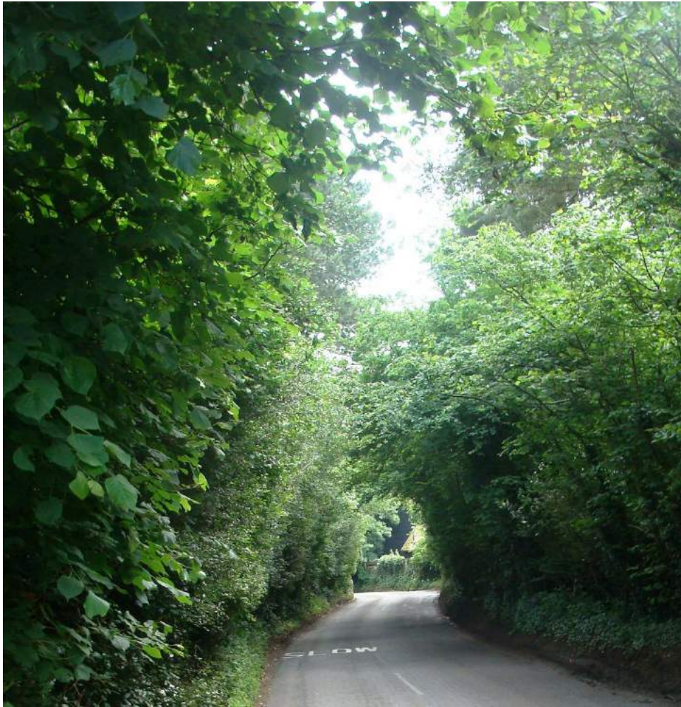
Picture 41. Similarly the enclosed nature north of Cheynes Lodge.

5.56. Hedgerows too play an important role in a number of locations, one of which is illustrated below.