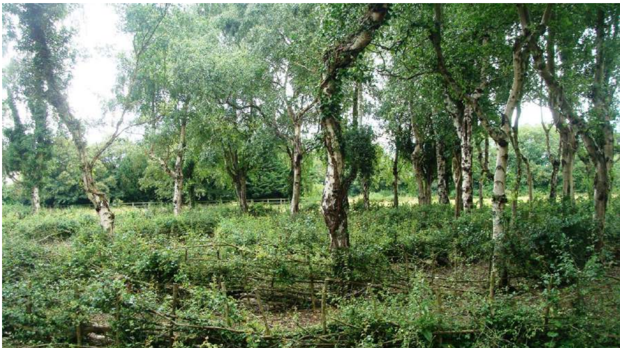
Picture 532. The Maze of early 20th century origin is currently being restored by the present owner. It consists of thorn hedging with mature birch trees. Some of the birch trees are past their prime.

5.69. For reasons previously expressed (particularly reference to its visual and historical landscape associations and also the legislation regarding trees in conservation areas) it is proposed to include the remainder of the Registered Park and Garden to the west of Cheynes House.