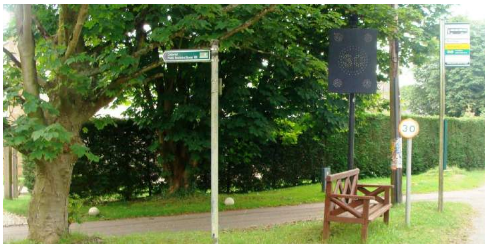
Picture 498. Could some rationalisation be achieved by combining some of the separately mounted signs on common poles?

5.65. Accumulation of signage etc on small triangular green immediately to the east of The Old Off License. This compact area contains a tree, a seat, byway sign on pole, 30mph sign on separate pole, bus stop sign on separate pole, speed advisory electronic display separately mounted and separate public utility pole. The whole is somewhat discordant where discussion between the parties could possibly result in some rationalisation.