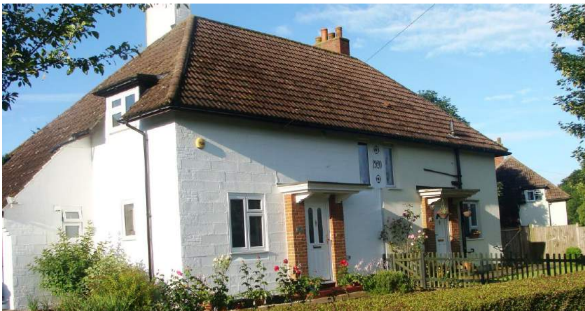
Picture 540. Housing at The Crescent dating from the early 20th century, unusual and retaining many of the original features including canopies, date plaques, chimneys and roofing materials. The retention of these features is most important.

5.68. Suggested boundary changes. It is proposed to extend the conservation in an easterly direction to include Nos. 25-40 The Crescent. These are properties built as council houses in the early 20th century. They are of block construction with tiled roofs and chimneys principally of blockwork. In the main they retain many of the original features including canopy features and plaques dated 1920 to fronts. Modern window solutions detract from original character. Despite such changes the whole group is unified by visually attractive common design features that justify their inclusion in an extended conservation area. They are of local historic interest. An Article 4 Direction to provide protection for selected features may be appropriate subject to further consideration and notification.