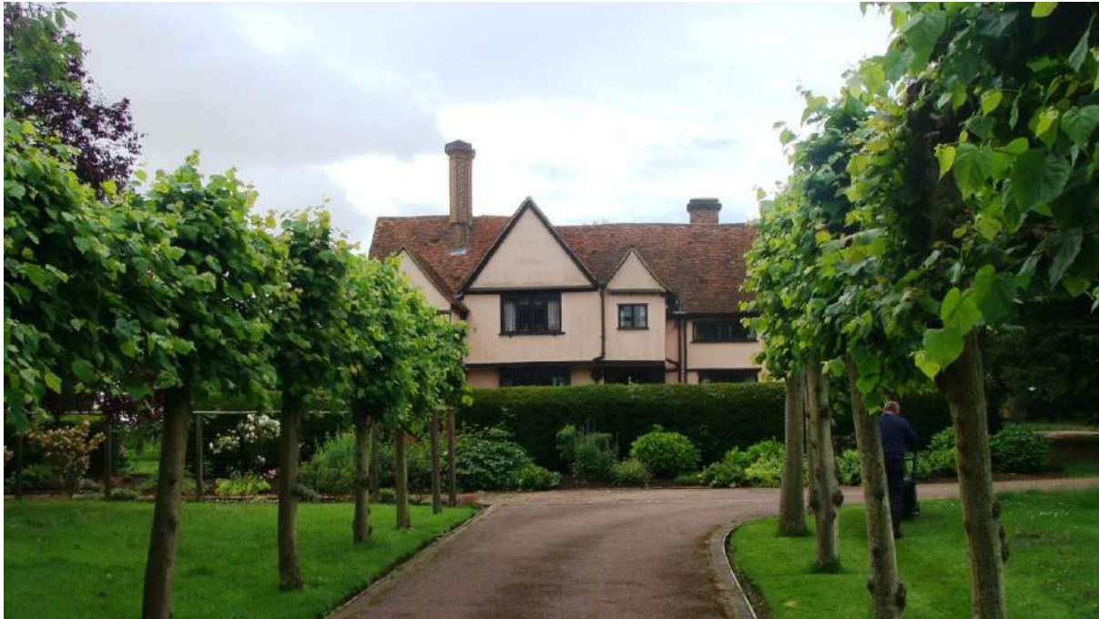
Picture 5. The Lordship is listed grade I and is a fine 15th century manor house.

5.14. The Lordship - Grade I. Early-mid 15th century (probably for John Fray who held the manor 1428-1461, altered in early 17th century (possibly by Edward Pulton between 1600 and 1608). Timber frame on low red brick sill, roughcast with steep old red tile roofs. Hall finally floored over and large external south chimney built in late 18th century. Other special features include pilastered 17th century fire surround and fine octagonal crown posts. A fine mid 15th century manor house with original structure and early 17th century wall paintings.