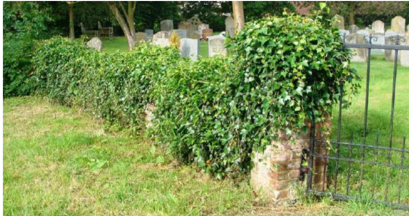
Pictures 22-23. The varied characteristics of the boundary wall to the church. Some repair work needed associated with selective removal of ivy.

5.42. Important Open Spaces. The spaces identified below are most important and should be preserved. Together with a significant number of trees they are an integral part of the conservation area and its overall high quality. The greens both sides of Baldock Road are significant environmental features of considerable visual importance. Of different character but important and worthy of preservation are the small enclosed pastures to the south and east of The Lordship and separated from the open countryside by a well used footpath. These areas with their different characteristics add to the spatial quality of the conservation area. Their present general configuration is very similar to that shown on late 19th century historic mapping.