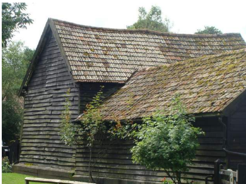
Picture 12. Barn at Cheynes Farm that is included on the Council's Heritage at Risk Register. Further investigation needed including discussions with the owner.

5.25. Ancillary building at Cheynes Farm, Warren Lane. The larger building at the southern end of the site is included on the Council's Heritage at Risk Register. As mentioned previously in the document grant assistance may be available for appropriate repair works. Further investigation needed including discussions with the owner.