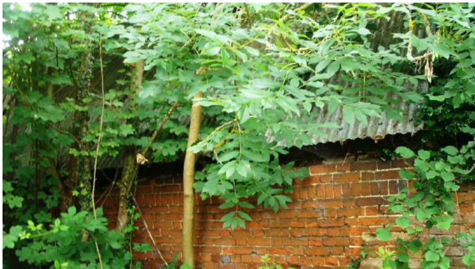
Picture 14. Ancillary building to Bull PH. Its corrugated roof may once have been thatched.

5.27. Ancillary building to the Bull PH. Of brick construction with corrugated iron roof.