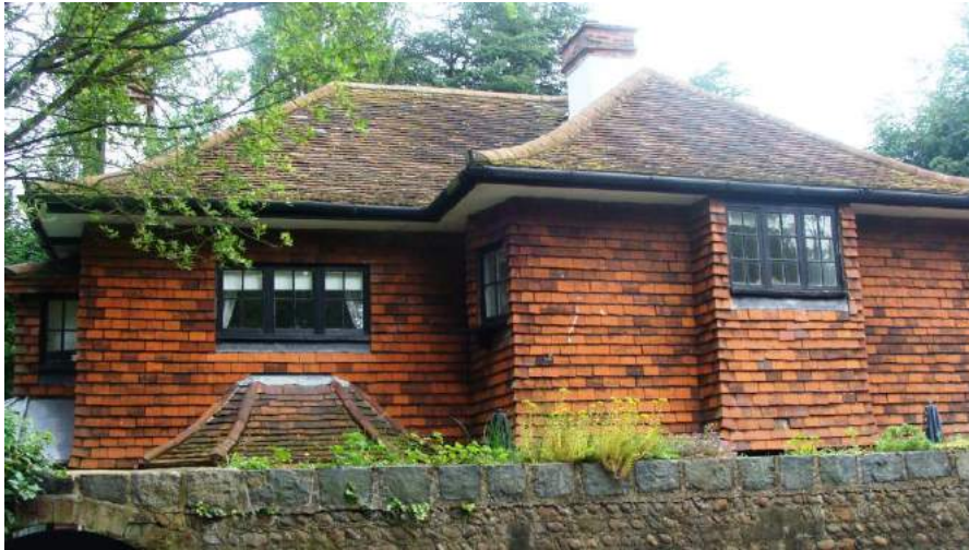
Picture 16. Cheynes Lodge an interesting building the location of which appears on mapping dating from the late 19th century mapping .

5.31. Victoria Cottages (Nos. 1-4) - Baldock Road. Of red brick construction with contrasting yellow brick quoin and door and window surround detailing. Slate roof; 2 No. chimneys and central plaque interpreted as reading 1887. An Article 4 Direction to provide protection for selected features may be appropriate subject to further consideration and notification.