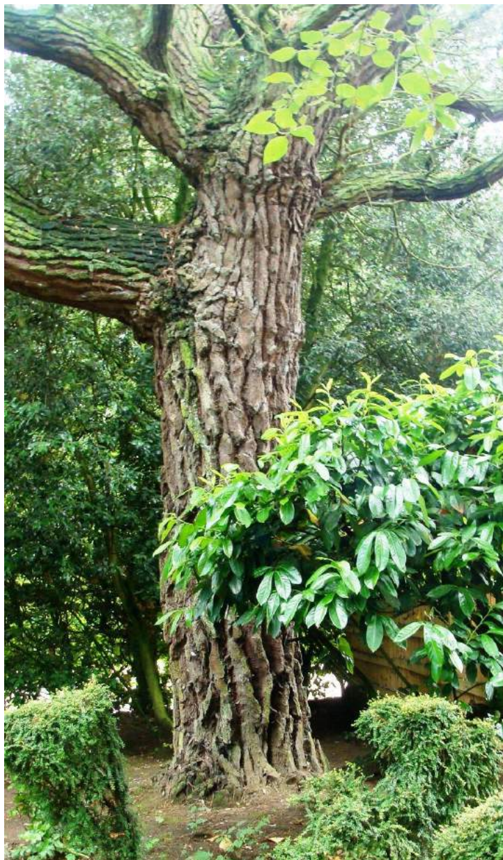
Picture 38. A magnificent tree within the grounds of Cheynes House, species uncertain but may be Japanese Black Pine. Can any reader assist?

5.53. Particularly important trees and hedgerows. Those trees that are most important are shown very diagrammatically on the accompanying mapping. As can be seen trees are important and extensive throughout the conservation area. Also and as previously advised some rear boundaries and other areas were not accessible so in such locations information regarding trees may be limited.