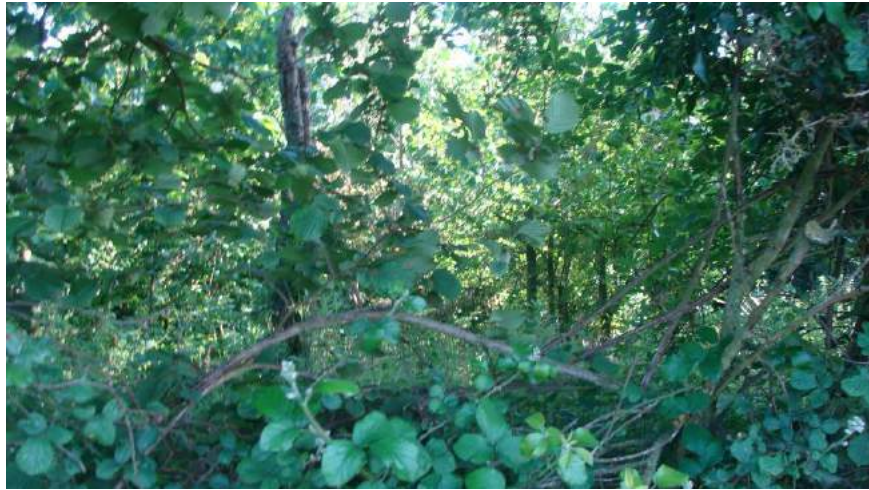
Picture 28. The now totally overgrown Friends burial ground. Is there any opportunity to make improvements and undertake research? Is there any local knowledge as to burials and grave markers that may be present?

5.47. Central Greens Baldock Road. Greens, some with significant and visually important tree planting, both side of Baldock Road, are open spaces of the highest quality that add significantly to the appearance and diversity of the conservation area. Their disposition is little changed over the last 100 or so years. They are well maintained and a credit to the community. They act as settings to important listed buildings or as larger open greens with mature trees. They are generally uncluttered by street furniture, a principle that is important and which should remain a guiding principle. There is a simple and well designed shelter at Bowling Green with seat providing rest and a view over the open space.