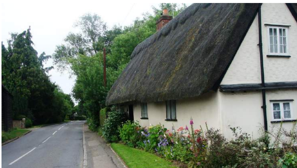
Picture 9. Paddocks Wells - another thatched property of quality which adds to the high visual environmental quality of Baldock Road.

5.19. Paddocks Wells, Baldock road - Grade II. Rebuilt on new site 1691 as part of Page's Charity. Timber frame roughcast with basketwork pargetting at ends, under a steep thatched roof. A long one and a half storeys house facing north with a rear outshut under a catslide roof.