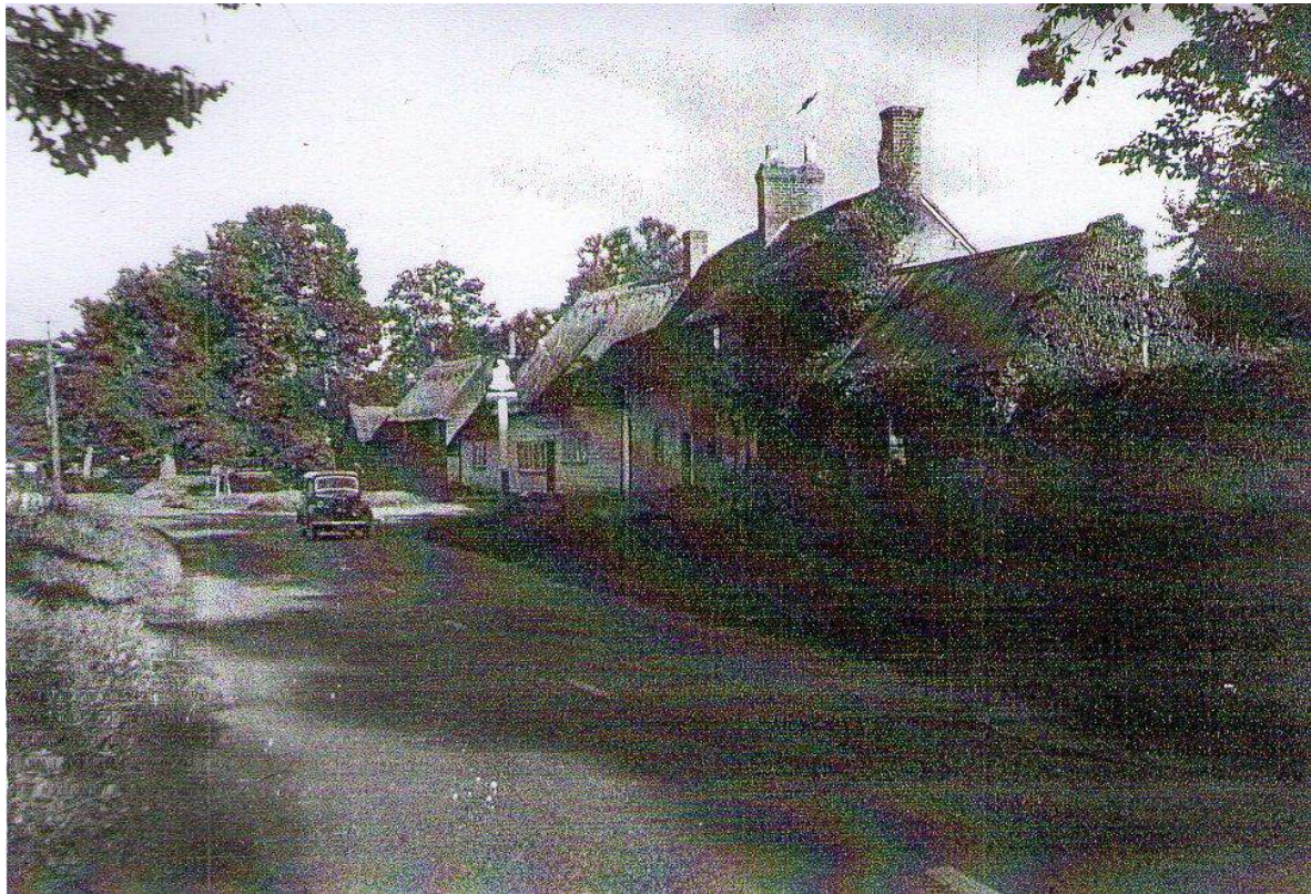
Picture 1. Cottered from the mid to later 20th century.

3.9. Commercial activities in addition to farmers listed in Kelly's at this time were Bull PH and shopkeeper, carpenter, wheelwright and blacksmith, higgler, (a pedlar or hawker) Bell PH and shopkeeper.