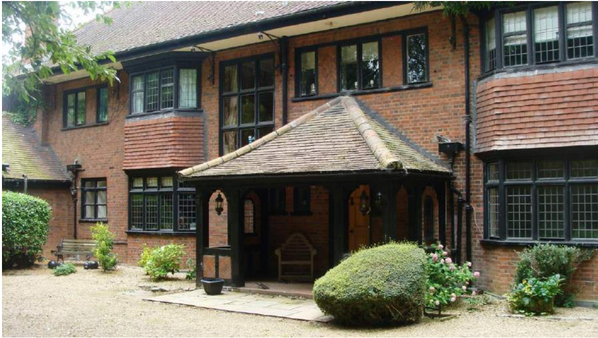
Picture 15. Cheynes House - a fine early/mid 20th century residence of quality with many features worthy of retention and additional protection.

roof and chimneys. Deep eaves and bay windows to both floors with vertically hung tile detailing. Fine small pane window detailing. The entry associated with Historic England's description of the grade II* Registered Park within which the building is situated reads thus The two-storey brick house was built by Herbert Goode during his second major period of development of the Japanese Garden. An excellent example of its period most worthy of retention. An Article 4 Direction to provide protection for selected features may be appropriate subject to further consideration and notification.