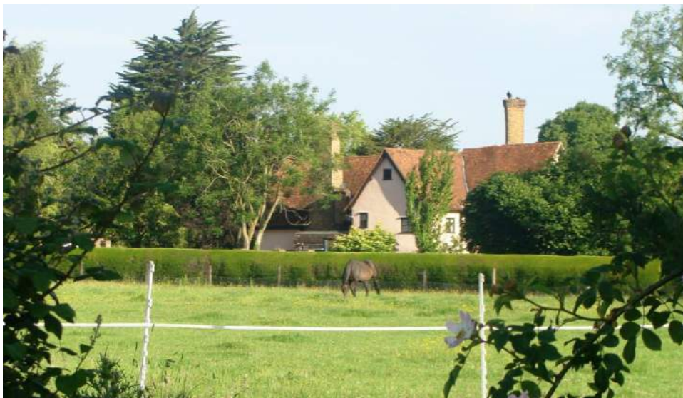
Picture 27. Paddock land which provides a setting for the grade I listed building The Lordship as viewed from the adjacent public footpath.

5.45. Similarly other small scale areas of paddock nearby provide a setting for important listed buildings as illustrated below.