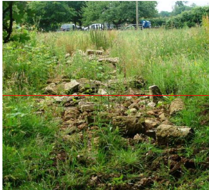
Picture 48. Dumped spoil/hardcore-modest effort could secure worthwhile visual improvements.

of abandoned material would secure improvements. Update: Improvements have now been made.