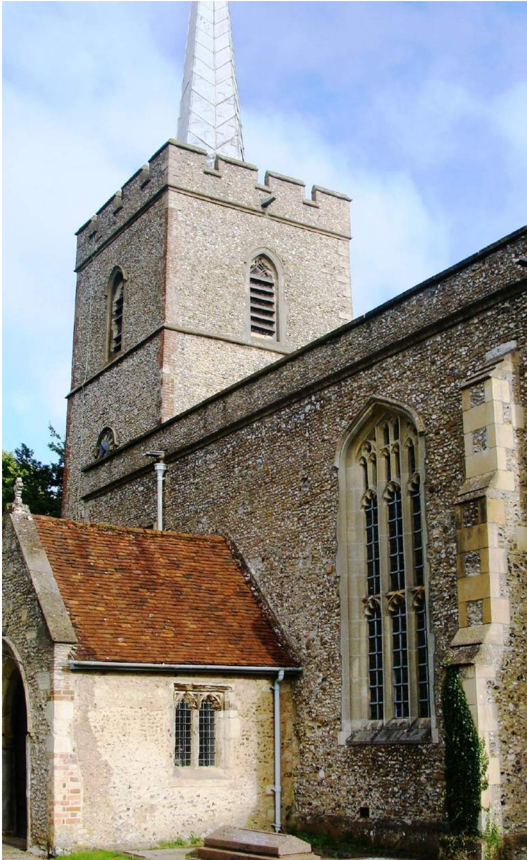
Picture 4. The church is almost wholly of medieval fabric of high quality, illustrative of the best medieval constructional techniques, masonry and carpentry skills.