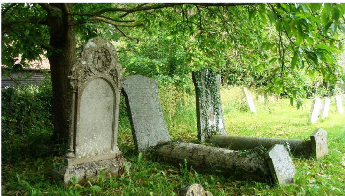
Picture 32. Traditional tombstones in the churchyard.

5.49. Important Historic Parks and Gardens. The Japanese Garden and parkland around and to the west of Cheynes House is listed Grade II* by Historic England. It is identified in the Council's Supplementary Planning Document Historic Parks and Gardens. Hertfordshire Archaeological records advise that the Japanese Garden Society considers it one of the three major tea gardens in the UK; it has a Japanese name, Koraku-en, which means the Garden of Good Luck and Good Life. A very much abbreviated description from Historic England is provided in italics below. Regrettably access was not obtained at time of original survey so it was not possible to illustrate with up to date photographs (it is understood new owners have taken possession so a future opportunity may present itself). However the fieldworker has recently visited the garden at the invitation of the new owners who are undertaking improvements and have commissioned a 40 page detailed management plan.