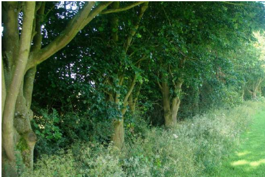
Pictures 24-25. Strong boundaries to the recreation ground enclose this well used open space and illustrate the high visual importance of trees in this part of the conservation area.

5.44. Meadow land to rear of Home Close Cottages. Small scale meadow land bounded by hedges and trees. Considered to be very much part of the spatial quality of the conservation area and very distinct and separate from the open countryside beyond. Importantly it is seen as such from the well used footpath adjacent.