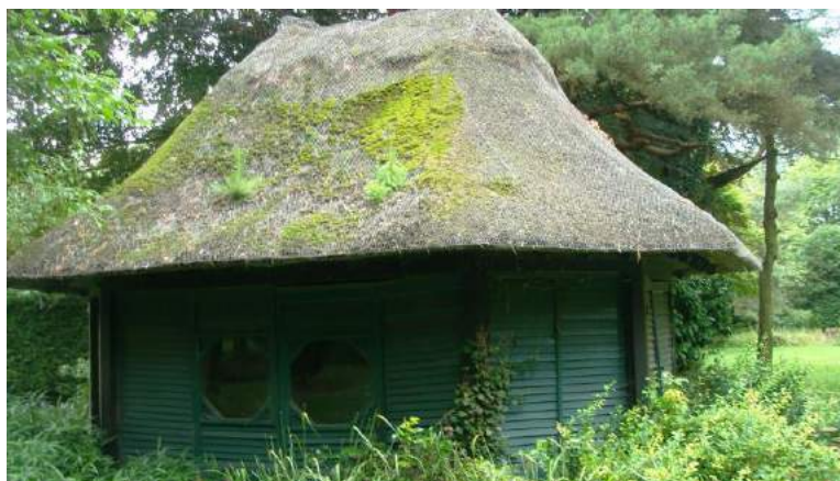
Picture 20. Interesting summer house unlisted in grounds of Cheynes House possibly dating from the early 20th century.

5.39. Small summer house in grounds of Cheynes House. Prominent feature of quality. Not examined but possibly dating from early 20th century and contemporary with planting carried out at that time.