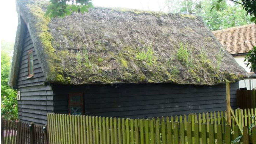
Picture 13. Ancillary building to the Old Forge whose thatched roof needs attention.

5.27. Ancillary building to the Bull PH. Of brick construction with corrugated iron roof.