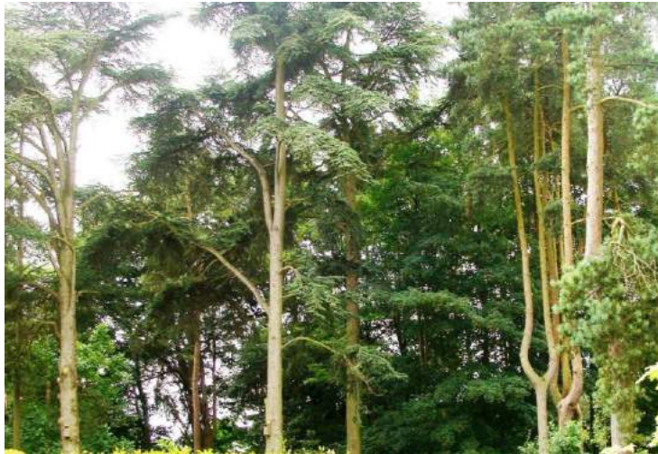
Picture 39. Fine Pine trees within The Garden House seen from the public domain, assumed to be Japanese species.

5.54. Throughout the conservation area trees play a very important role in adding quality to the environment generally and enhancing the historic built form as several previous pictures illustrate.