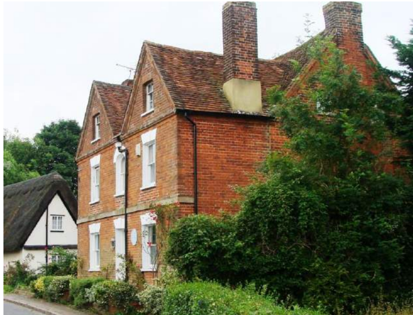
Picture 18. The Kennels a tall prominent building in the street scene that makes a significant architectural and historical contribution and one most worthy of retention and additional protection.

frequently visited by SUN YAT SEN (between 1896-1911) who is credited with being 'father of modern China'. An Article 4 Direction to provide protection for selected features may be appropriate subject to further consideration and notification.