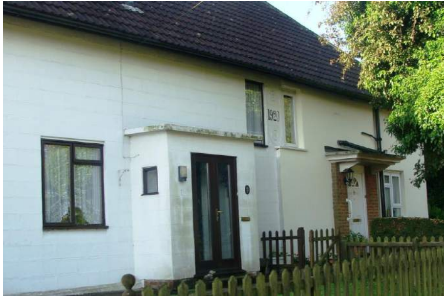
Picture 521. A property at The Crescent where regrettably the original canopy feature has been replaced. An Article 4 Direction as proposed would provide control in relation to the exercise of householder Permitted Development Rights. Some properties (right) have blockwork subsequently rendered.

5.69. For reasons previously expressed (particularly reference to its visual and historical landscape associations and also the legislation regarding trees in conservation areas) it is proposed to include the remainder of the Registered Park and Garden to the west of Cheynes House.