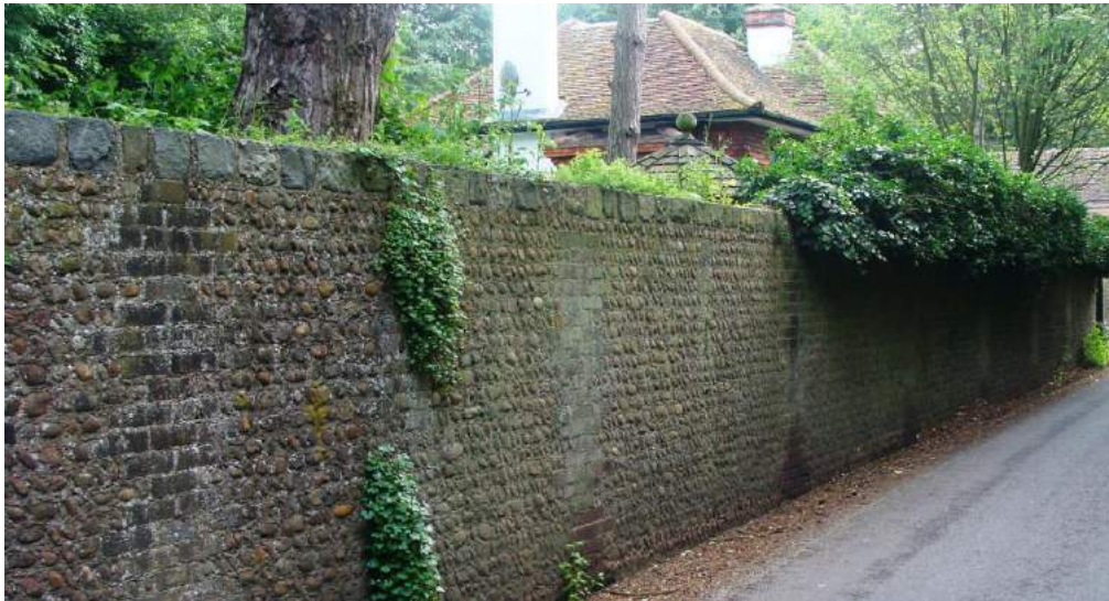
Picture 21. Prominent and unusual wall to front of Cheynes Lodge.

5.40. Wall to front of Cheynes Lodge. Approx 2m in height constructed of brick with rounded pebble detailing and stone capping. An unusual and prominent feature in the street scene. Selected removal of vegetation would be beneficial.