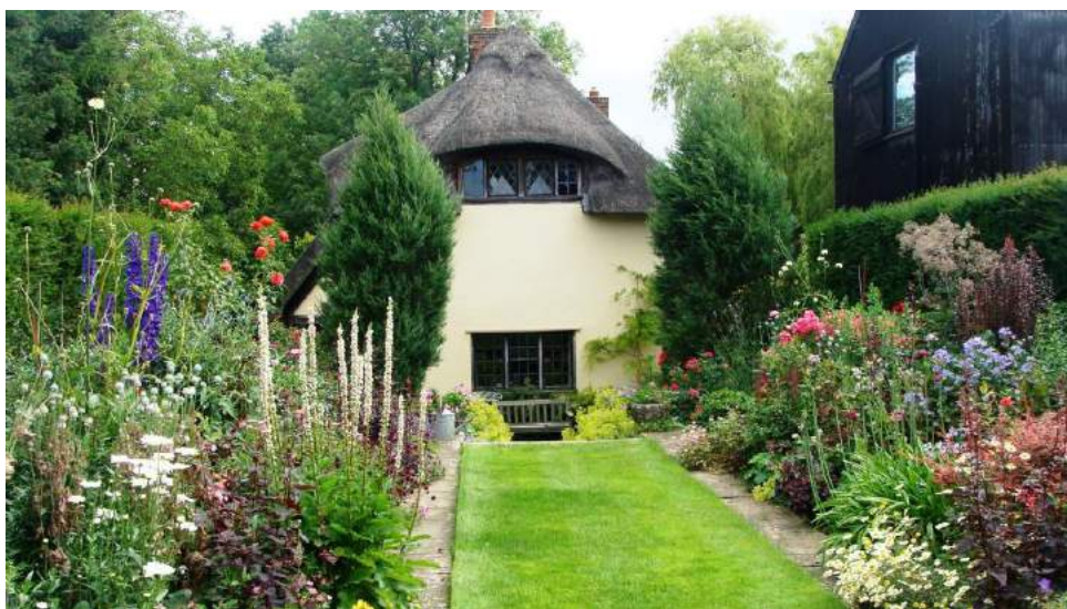
Picture 11. Lower farm viewed from herbaceous garden area.