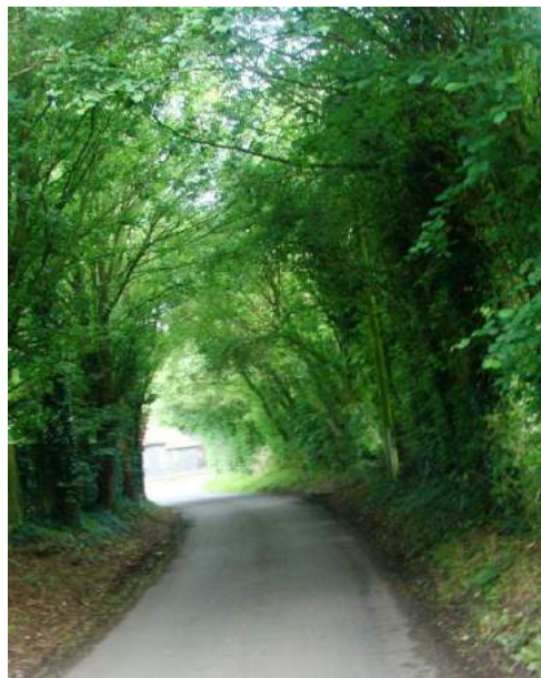
Picture 40. The village approach looking along Warren Lane. It is important to retain such landscape features.

5.55. Village approaches with overhanging trees are important to the character of Cottered in several locations.