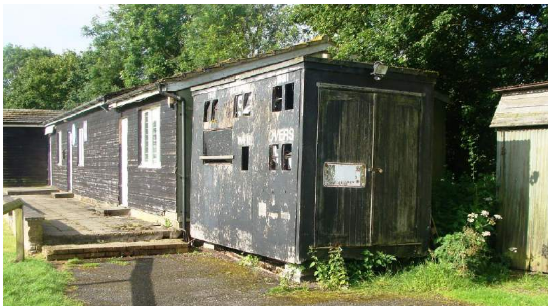
Picture 44. The cricket pavilion and associated facilities would benefit from improvements.

5.60. Elements out of character with the Conservation Area. The Cricket Club pavilion and scoreboard. The pavilion would benefit from being repainted and the scoreboard could be improved to make it visually more attractive.