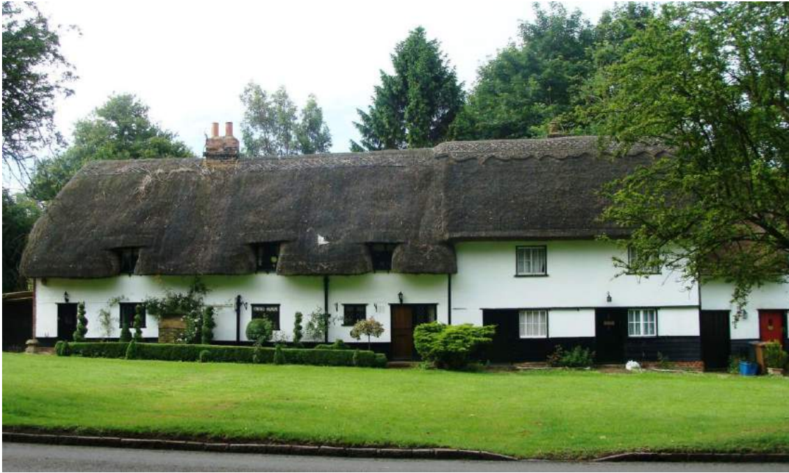
Picture 6. Home Close Cottages, picturesque with steeply sloping thatched roof and eyebrow dormers.

5.16. The Bull P.H. Baldock Road - Grade II. Early 18th century or earlier. Timber frame roughcast with steep old red tile roof and bellcast eaves. A long, 2- storeys and cellar house. Said to have been a butcher's shop for 100 years. Manor court held here in 19th century.