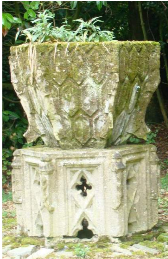
Picture 3. Octagonal Drum architectural fragment - Garden fragments now in the grounds of Cheynes House and said to be from Barry's Palace of Westminster- listed grade II.

5.12. Architectural fragments in Italian Garden - fragments now in the grounds of Cheynes House. Mid 19th century said to be from Barry's Palace of Westminster, brought here after being displaced in a Fenian outrage of 1932. Carved freestone. A large octagonal drum with each face panelled with Gothic arches. Reversed on top of this stone is a large pointed octagonal capstone with chevron grooving on each face.