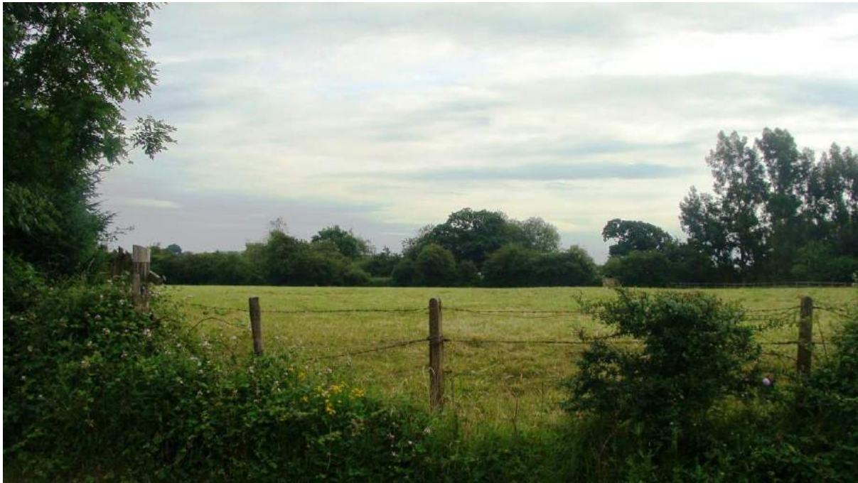
Picture 543. Open countryside to the north and west of Childs Farm which is proposed to be excluded from the conservation area.

extremity of the conservation area as this area is considered to be more closely associated with the open countryside. However it is suggested the boundary be redrawn to retain a small copse of trees adjacent to the road.