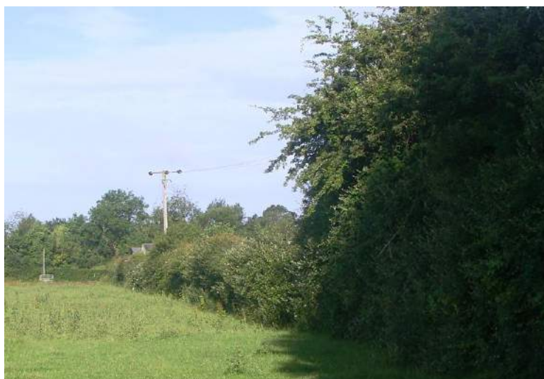
Picture 42. The importance of hedgerows. This one to the south of The Lordship is a strong boundary which separates the conservation area from adjoining open countryside.

5.56. Hedgerows too play an important role in a number of locations, one of which is illustrated below.