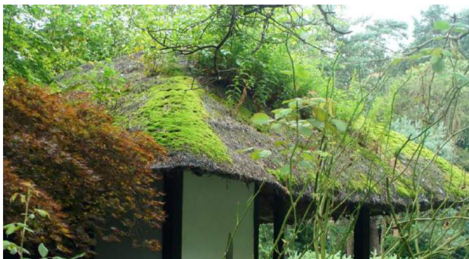
Picture 2. A listed structure in the Japanese Garden with deteriorating thatched roof; a candidate for the Council's Heritage at Risk Register subject to further investigation. This building was observed and photographed from adjoining Cheynes House.

5.10. Resting House in Japanese Garden at Garden House - Grade II. 1923-6. Personally constructed by garden designer S. Kusumoto for Herbert Goode (1865-1937) a wealthy glass and china merchant who began the Japanese Garden in 1905. Timber frame with hipped thatched roof. A single-storey open-sided shelter facing north, with low screens to front and side and traditional roof-structure of interwoven beams built up in stages, called AZIRO-GUMI. Floor made to represent the back of a tortoise signifying good luck.