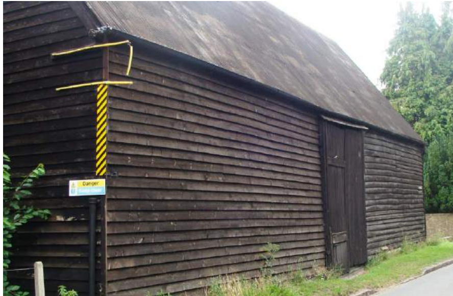
Picture 10. Prominent listed barn north side of Baldock Road. In all probability the roof would at one time have been thatched. A prominent feature at the entrance to the village and conservation area.

5.20. Barn at Childs Farm - Grade II. Early 17th century. Timber frame on low tarred brick sill, black weatherboarded with a steep pitched roof now covered in black corrugated iron. A tall 5 bay barn facing north alongside road with double doors on each side in middle bay. Prominent feature at entrance to village conservation area.