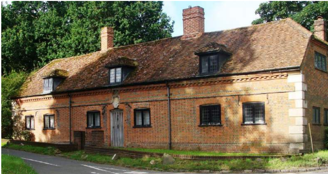
Picture 8. The Town House- picturesque group of former almshouses.